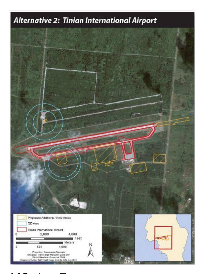
The CNMI is excited to have the US Air Force presence in our region regardless of which island it is on.